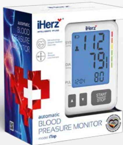
Automatic blood pressure monitors